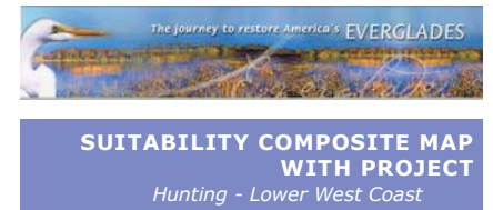
SUITABILITY COMPOSITE MAP WITH PROJECT Hunting - Lower West Coast