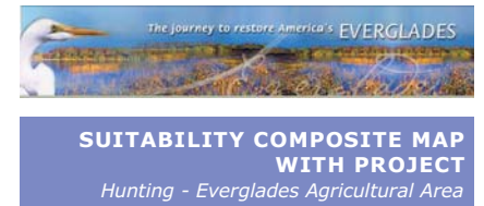
SUITABILITY COMPOSITE MAP WITH PROJECT Hunting - Everglades Agricultural Area