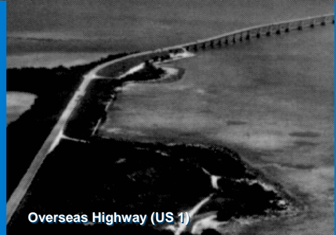
Overseas Highway (US 1)