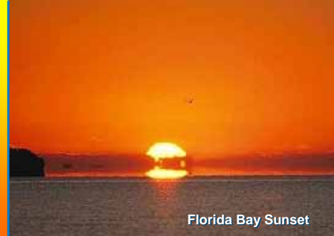
Florida Bay Sunset